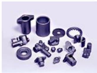
Cast parts for automobiles

Small cast products by Tsubakimoto Casting Co.: Weight 1 kg/unit max., average 300 g/unit