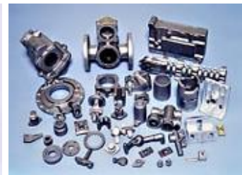
Cast parts for industrial machinery